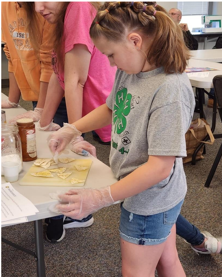
Figure the kinds and amounts of food according to persons and occasion for which the meal or snack is planned. In addition, consider foods that are in season. Also make sure the foods can be prepared within the available time and with the equipment on hand.

Contrast Textures: Juicy orange wedges, crispy chewy toast and smooth cocoa.